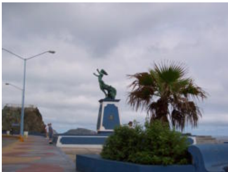
Another of the beautiful monuments you can view along Mazatlan's Malecon.