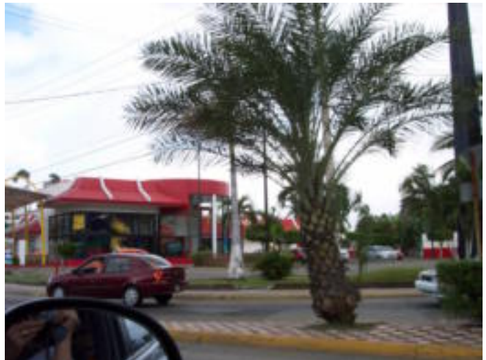
A McDonald's in Mazatlan - very near Valentino's. Most of the menu you will be able to recognize.

A multi-party system forms the basis of democratic coexistence in Mexico. The main political parties are the Institutional Revolutionary Party (PRI), the National Action Party (PAN) and the Party of the Democratic Revolution (PRD). All registered political parties may nominate candidates for local and federal elections.