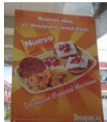
And, like I said, you will recognize most of the items at McDonald's.

This program is open to all foreigners regardless of nationality and/or immigration status.